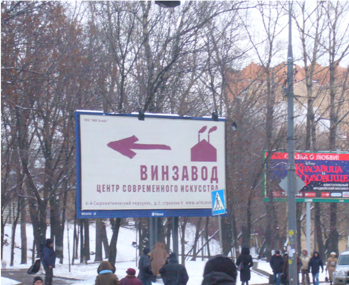
Poster of Winzavod

Gallery and Photographer.ru. At the end of 2009, there were 13 galleries at Winzavod, some of which participate in international contemporary art fairs. The galleries can have their exhibition program, but they are asked to follow the Winzavod style when forming their permanent program.