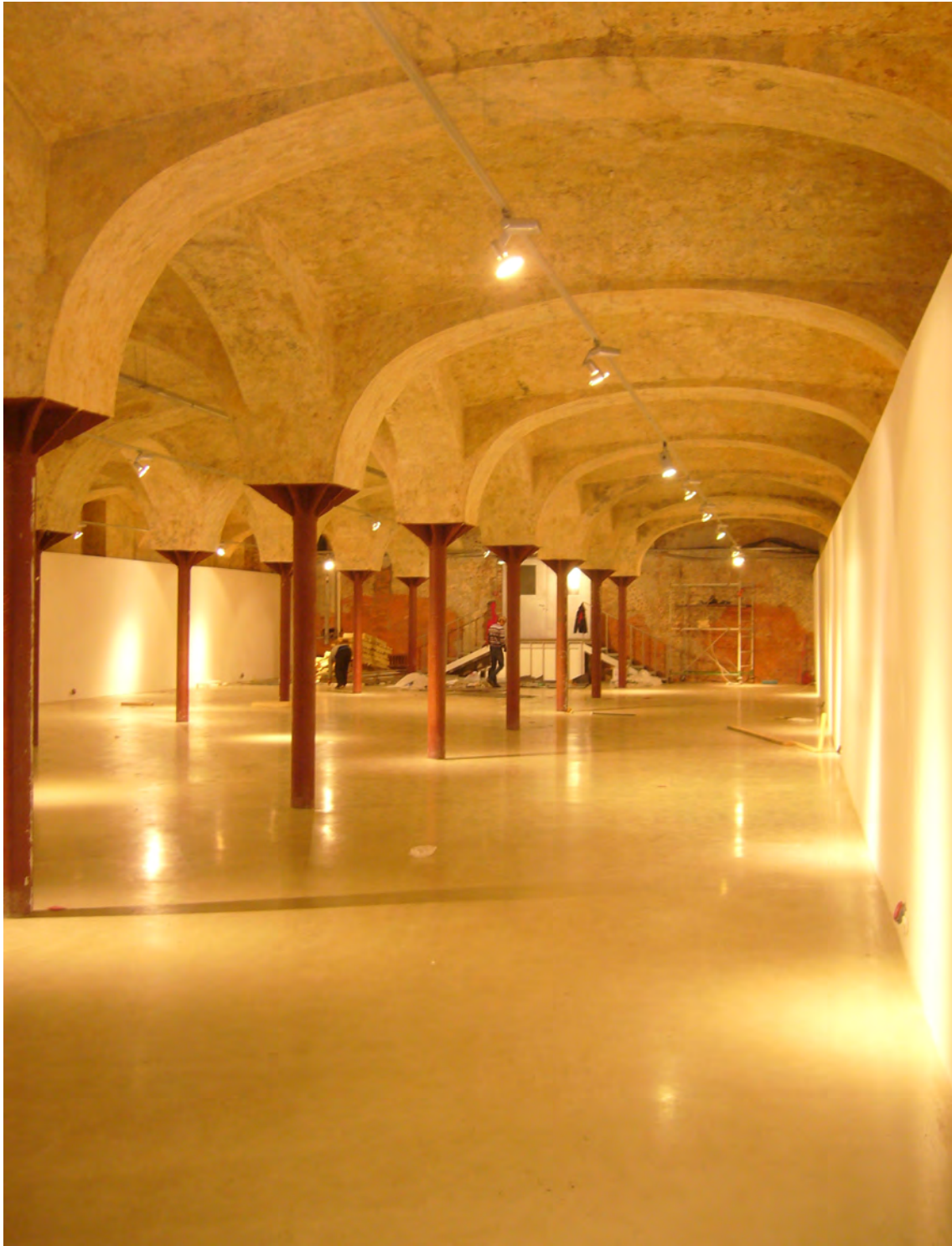
Red Hall in Winzavod

to make it more business oriented than it is today. The mission of Winzavod is to support contemporary art and artists, to introduce contemporary art to the widest possible audience, and to make art an integral part of contemporary life. 50