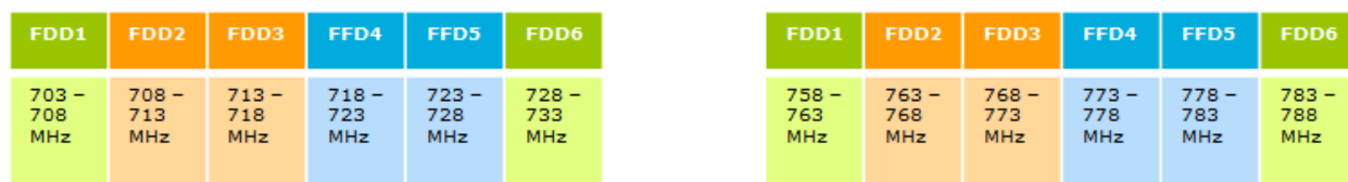
Figure 3: Fragmented allocation of licenses.

Fragmentation risk, while similar to exposure risk, refers to a more specific situation where a bidder obtains spectrum licenses that are not contiguous. As this is inefficient use of spectrum, it is in direct conflict with one of the main objectives of the auctioneer. Pareto improvements could be made by simply switching around the licenses between winners, but fragmentation often occurs in situations where only one of the bidders has incentives to change allocation while other two are completely satisfied with their current licenses and hence indifferent (or sometimes reluctant) to switch. Such a scenario is depicted in figure 3 with three bidders bidding on six licenses. Each color represents the licenses bidders acquired in the final allocation. Only the green bidder (and the auctioneer) is unhappy with the allocation.